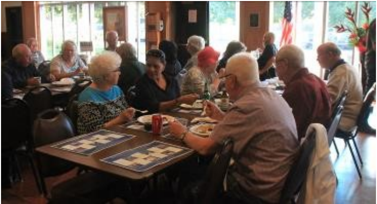
← Parishioners and friends enjoy the finest Oktoberfest meal served in all of Concord (that day).