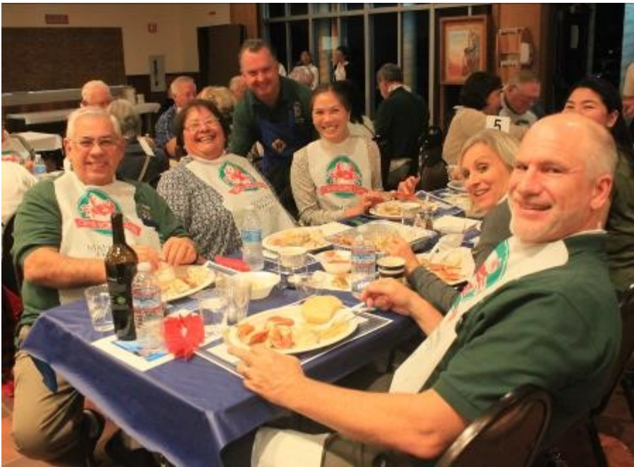
↓ Knights and their families enjoy crab, tri-tip, wine, and good company.